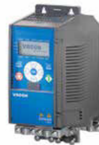
Option board mounting kit