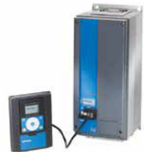
Keypad door mounting kit