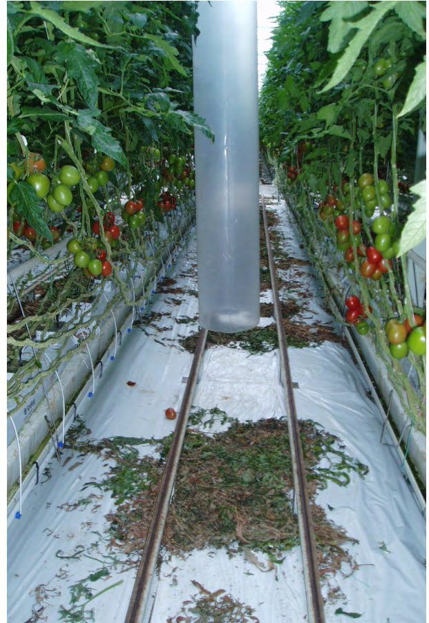
Hose in the path