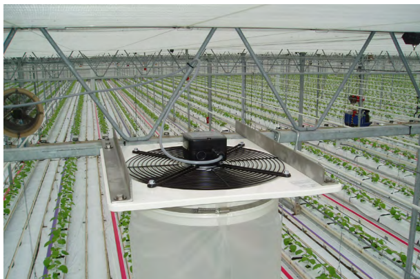
Straight mounting brackets