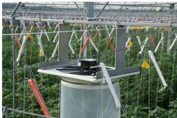
Lower type mounting brackets