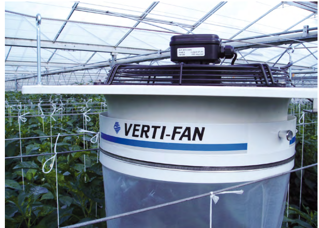
Coupling ring for Verti-Fan®

With the newly developed coupling ring, fitting the ducting to the fan has become really simple. The made to measure ducting pipe is first fitted to the coupling ring – thanks to the accuracy of the dimensions, the ducting fits perfectly around the ring. A s/s hose clamp is used to secure the pipe to the ring. The ring – complete with fitted ducting – then simply click-fits to the fan by means of the assembly pins.