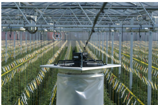
Stainless steel cable