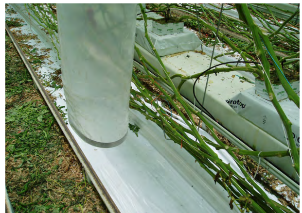
Hose between the crop