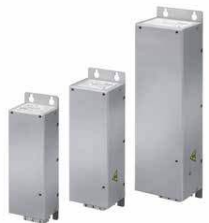
Frame sizes Three different frame sizes of line filters correspond to the M1, M2 and M3 enclosures of the VLT® Micro Drive