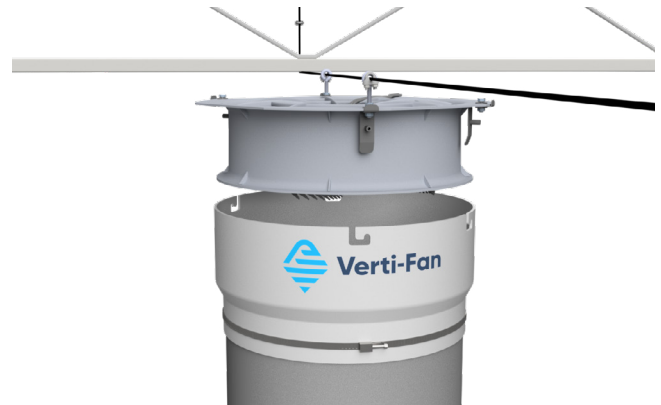
Coupling ring for Verti-Fan®

With the newly developed coupling ring, fitting the ducting to the fan has become really simple. The made to measure ducting pipe is first fitted to the coupling ring – thanks to the accuracy of the dimensions, the ducting fits perfectly around the ring. Using a hose clamp to secure the ducting pipe to the mounting ring, the ring – complete with fitted ducting – then simply click-fits to the fan by sliding the openings in the mounting ring over the spacers.