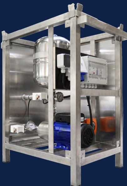
Hydrophore unit 1-phase

Van der Ende Group also gave attention to safety and reliability. André: 'There's a safety switch integrated in the unit to make sure that none of the other components are damaged if something goes wrong. The unit sends an automatic signal if anything malfunctions.' The pump can raise water to a height of 110 meters, which is more than enough for most high-rise buildings. To meet customer wishes for a competitively priced alternative for lower buildings, a version with a single phase motor was developed in consultation with RECO. This reaches a height of 60 meters.